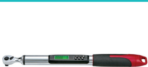
Digital Torque Wrench

Set up in July 2010 with capitalization of about US$338,400, we engage mainly in R&D, fabrication and marketing of electronic hand tools, consumer electronics, and mechatronics. Our founder, whose family has some 20 years' experience in exporting toolboxes, has comprehensive knowledge of R&D and know-how to turn out not only conventional but also high-tech products after 7 years in IC design and hand-tool fabrication.