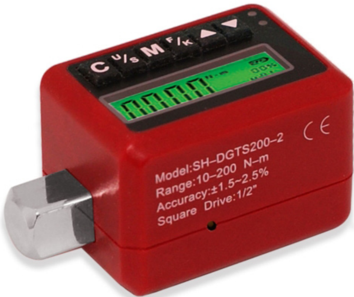
Digital Torque Display