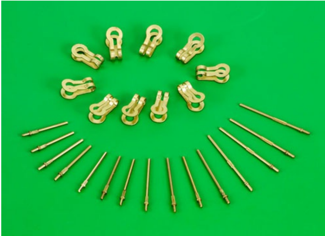
Pins for Electronics (critical motherboard parts)