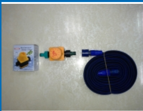
Timer with Elastic Garden-hose with Timer