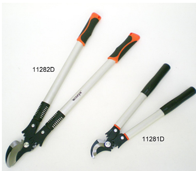
Gear Transmission Lopper