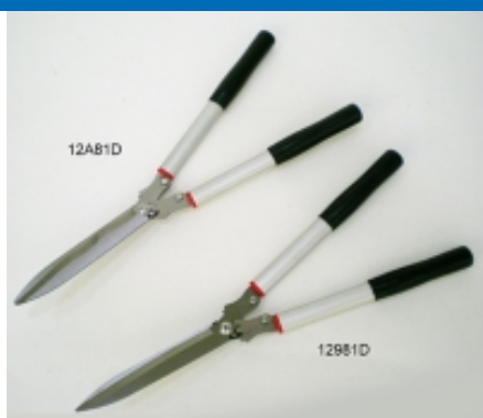
Gear Transmission Hedge Shear