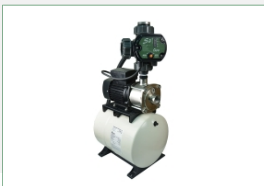
S3 puls MTS