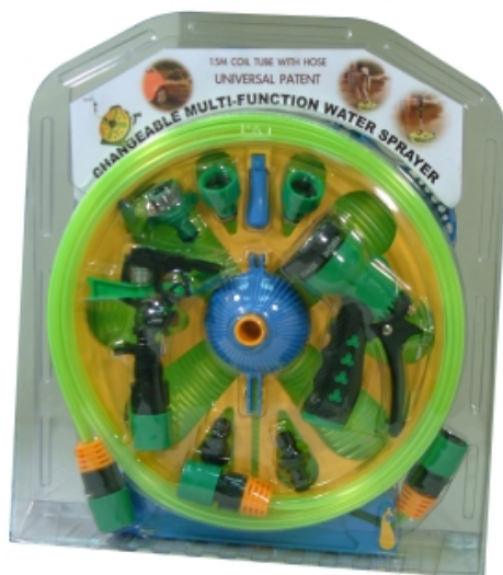
Multifunctional K/D Sprinkler &amp; Hose Set