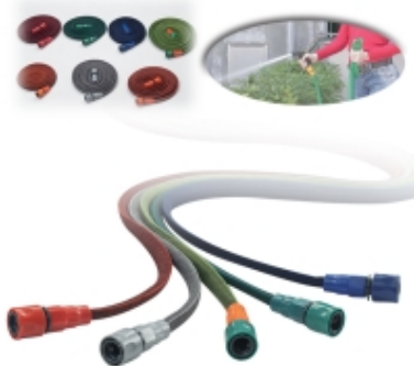
G-hose Extendable & Elastic Garden Hose