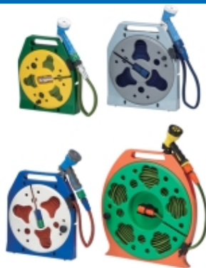
Elastic Garden-hose with Winder