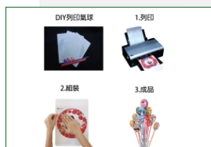
D.I.Y. PRINT BALLOON