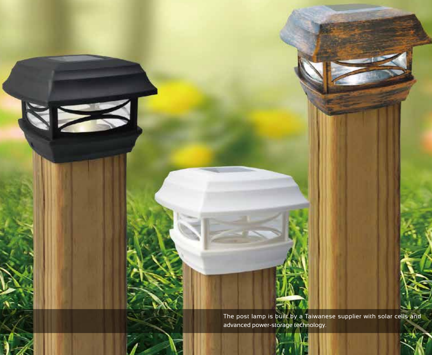
The post lamp is built by a Taiwanese supplier with solar cells and advanced power-storage technology.

With the National Association of Home Builders predicting size of homes to shrink by 10 percent in 2015 on average, ever more people therefore go outside the home for not just holding parties, but dining, cooking and