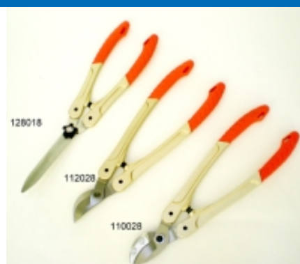
Aluminum Alloy Forged Handles Lopper