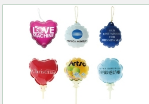
SELF INFLATABLE BALLOON

As the inventor of auto balloon and printable balloon, we have produced customized foil balloons over 25 years in Taiwan . We have the new technique for small amount order : MOQ: 1 000pcs for customized design balloon with full color by digital imprint, including auto and blow balloons, and helium balloon. 1.) auto balloon (self inflatable balloon) :According to the chemical reaction of Acid (food grade lemon acid) mixed with soda powder, the mixture creates Carbon Dioxide Gas(CO 2 ) to fill in the balloon. 2.))Diy printable balloon : Patent product balloon printed by all inkjet printer . All balloons are customized and personal . 3.)Blow and Helium balloon We are specializing in customized balloon , and all shape available including self-inflatable balloon , blow and helium balloons.