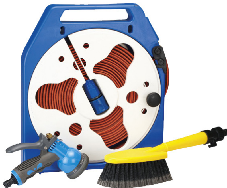
Multi-function car brush