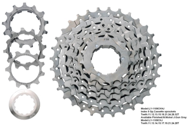
Model:LY-1109CKHJ Index:9 Sp.Cassette sprockets Teeth:11,12,13,15,16,21,24,28,32T Available Finished:N,Nickel J-Gun Gray Model:LY-1109CKJ Teeth:11,13,14,15,17,19,21,24,28T