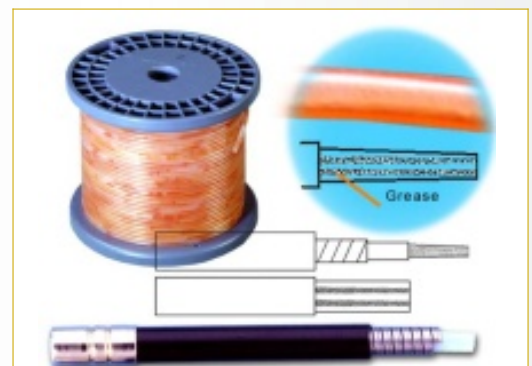
Interior lubricated tube for Control cable