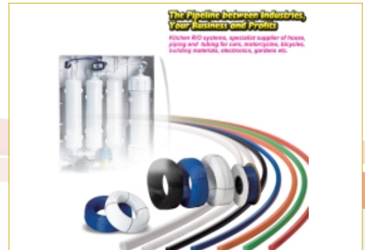
Kitchen R/O Systems