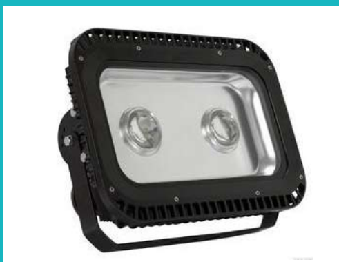
LED tunnel light

Our company is one specialized is engaged in LED lighting research and development, production and sales in the integration of high-tech enterprises.