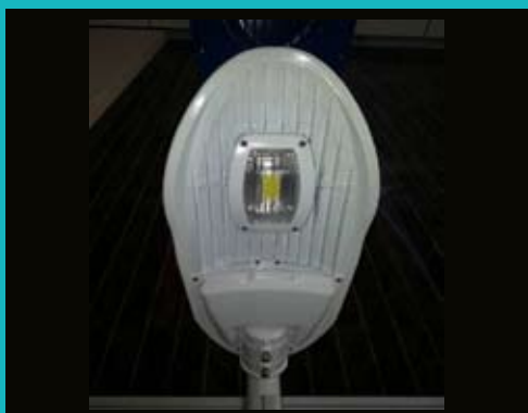
LED street lamp