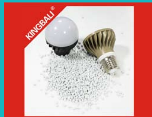
Thermally Conductive Plastic