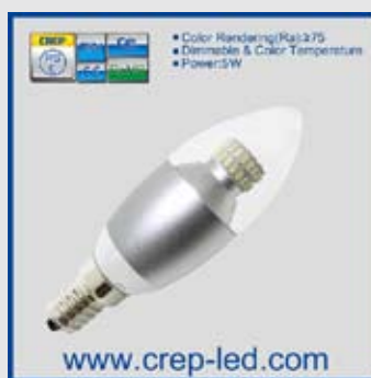
LED Candle Light