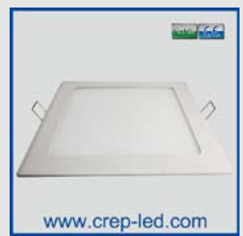
LED Panel Light