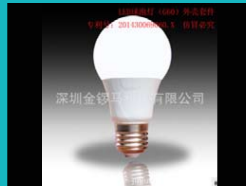
Thermal-conductive plastic parts for 5-8W LED globe lights, E27 lamp covers