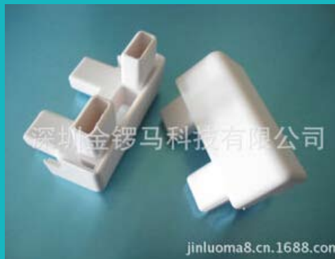
Plastic accessories for LED lamps