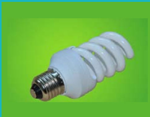
Full Spiral Energy Saving Lamp