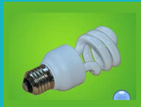
Semi Spiral Energy Saving Lamp