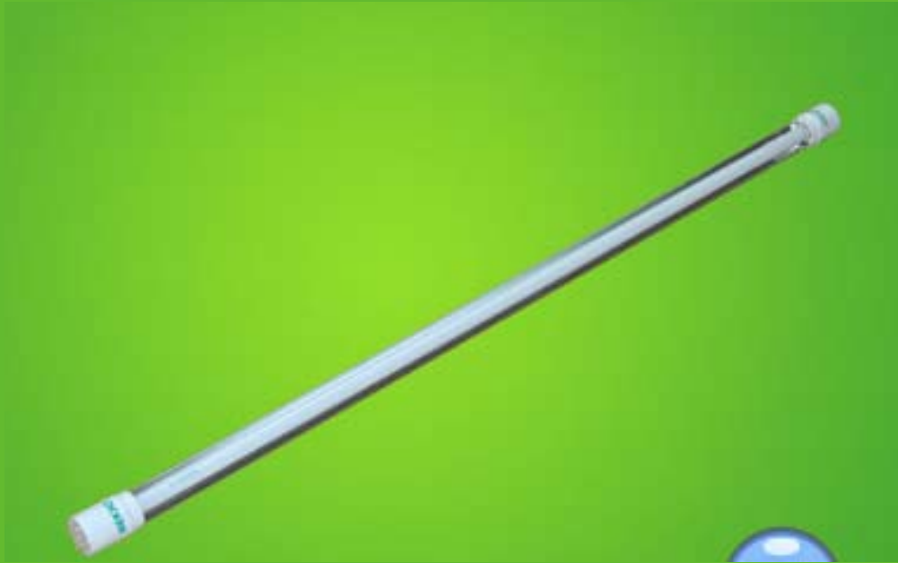
Pipe-in-pipe Energy Saving Lamp