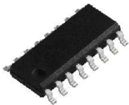
LED decorative IC

Double Microelectronics supplies mainly high-performance A/D and D/A converters, LED drivers, and communication interface ICs. We have developed exclusive signal-mixing technology in PWM, which enhances efficiency, quality of our DC/DC and AC/DC products. Our LED series also feature high performance, reliability, and high energy-efficiency.