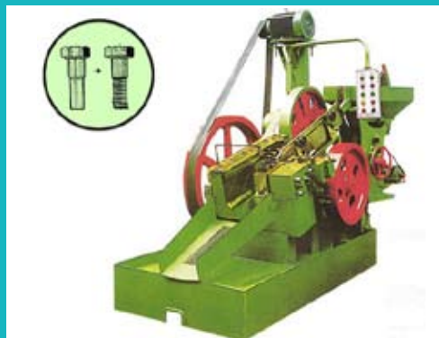
DIEPLATE TYPE THREAD ROLLING MACHINE