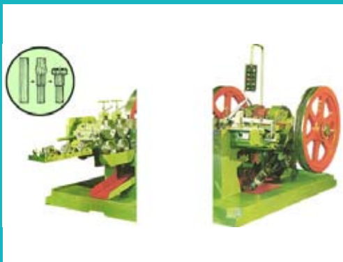
DOUBLE STROKE COLD HEADING MACHINE

1.Fastener forming tools factories: Our tools making factory equipped with vacuum heat treatment furnace made by B.M.I., France and tin coating equipment.