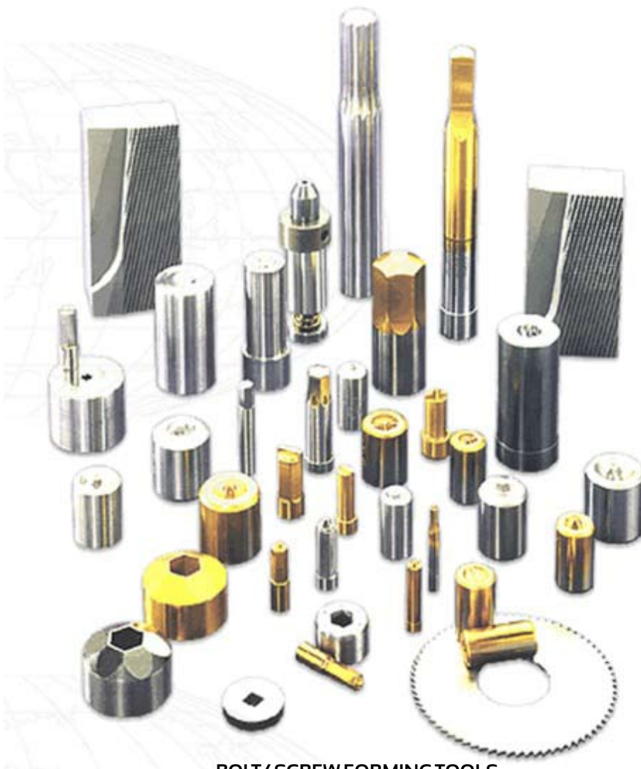
BOLT/ SCREW FORMING TOOLS