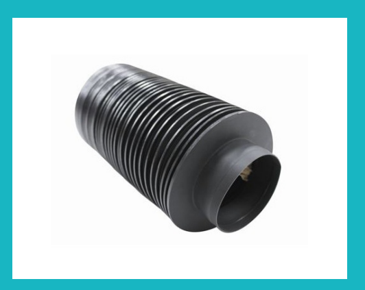
Roller Bellow Covers

SUN YUAN established in 1989, With over 20 years in design and manufacturing experience of machine cover, we have been dedicated to the design and manufacture of a wide rang of machine protection systems. For example Bellow Cover, Finned Bellow Covers, Roller Covers, Roller Bellow Covers, Apron Covers, Wipers & Machine Brushes. SUN YUAN protection ... [more]