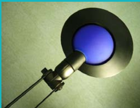
Electronic Driver for LED