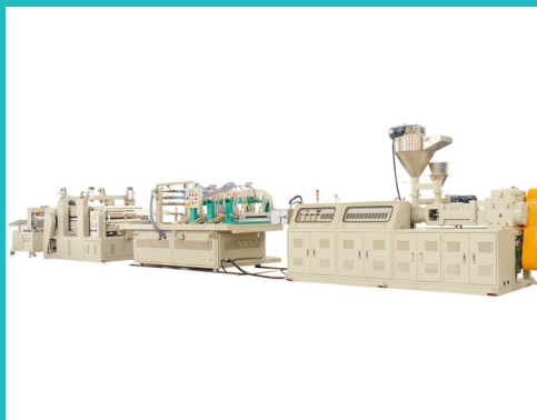
PVC Profile Production Line: PVC COMPLETE PRODUCTION LINE FOR LARGE VOLUME PROFILE