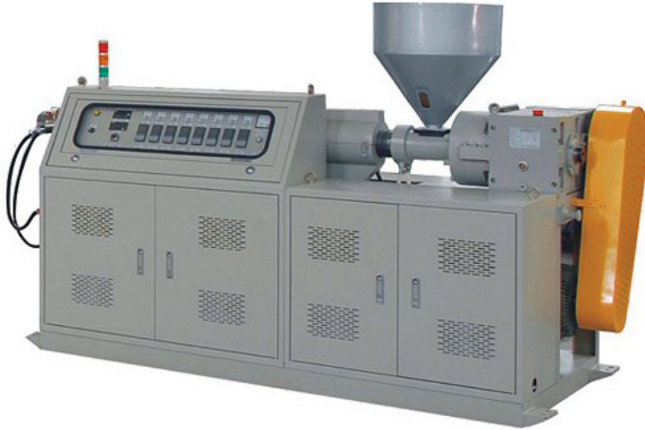
Pipe/Hose Production Line: PVC YARN REINFORCED HOSES EXTRUSION MACHINE