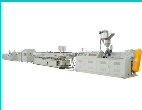
Pipe/Hose Production Line: PVC TWIN SCREW DUAL LINE RIGID PIPE MAKING MACHINE

TECHPLAS Machinery Co. Ltd., founded in 2005, is a professional supplier specialized in designing and manufacturing PVC extrusion equipments (including turnkey solution) in Taiwan, applied to pipe, profile and pelletized products.