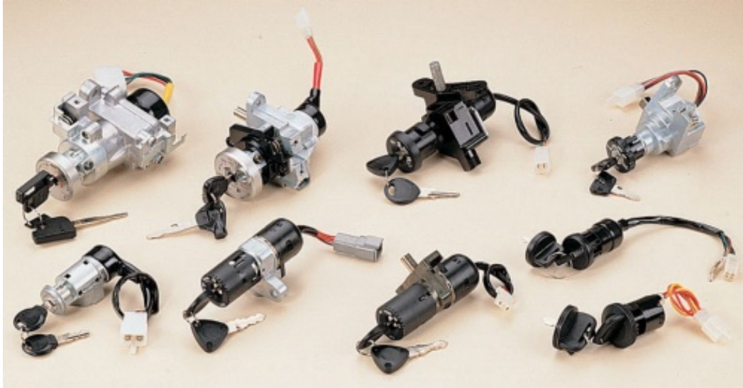
motorcycle main switches