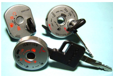
shutter magnetic lock

Formosa Seiko Electronic Co., Ltd. (the abbreviation is JINKUN) was established in 1974 ,and manufacturers motorcycle main switches ,shutter magnetic lock, seat lock, helmet lock, oil level gauge, fuel tank fill cap lock and electronic parts such as regulator. We have over 30 years experience in product development and provide high quality OEM pa ... [more]