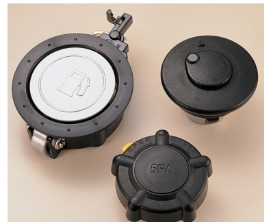
fuel tank fill cap lock