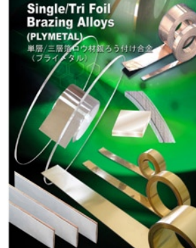
Phosphorus Copper Alloys

Single/Tri Foil Brazing Alloys (PLYMETAL) 単層/三層箔ロウ材銀ろう付け合金 (フライドタル)