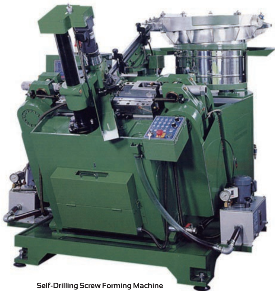
Self-Drilling Screw Forming Machine