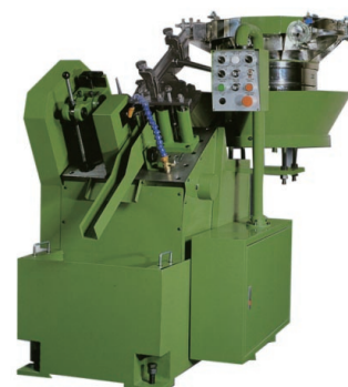
Self Tapping Screw Point Cutting Machine