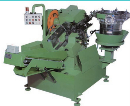
High-Speed Thread Rolling Machine