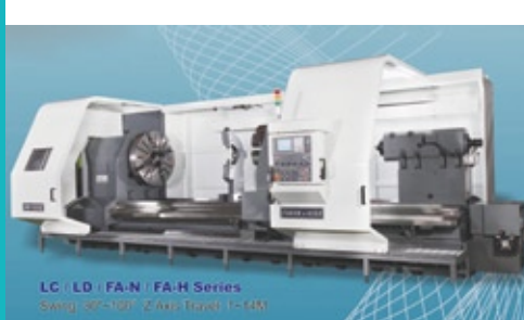
LC / LD / FA-N / FA-H Series Swing: 30~130" Z Axis Travel: 1~15M