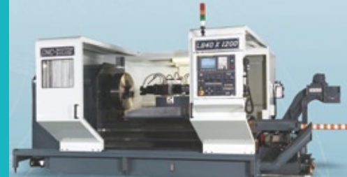
Turning Master Model: LB40 x 1200 Swing: 1000mm Z axis Travel: 1360mm