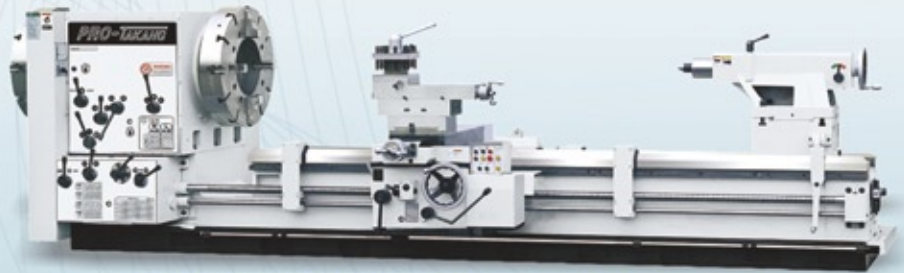
Heavy Duty Conventional Lathe (Big Bore) Swing: 450~2500mm BC: 2~15M