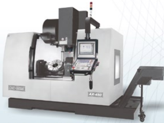
5 Axes VMC AX-450 Table Dia.: 450mm