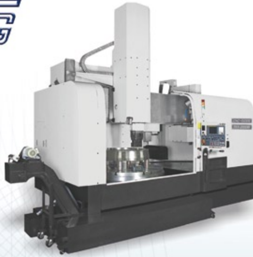
TKV-2000 CNC Vertical Lathe Max. Turning Dia.: 2000mm Max. Turning Height: 1250mm Max. Load: 8000kgs Bearing Dia.: ID 685mm Table Speed: 3~250rpm Various models are available: (Cutting Dia.: 760~4500mm)