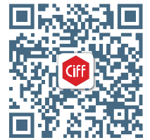
WeChat + QR Code