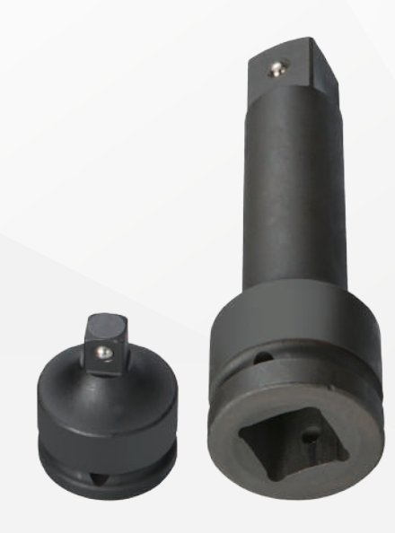
Impact Adapter Impact Extension