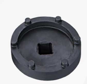
6 Lug Dodge Axle Nut Socket