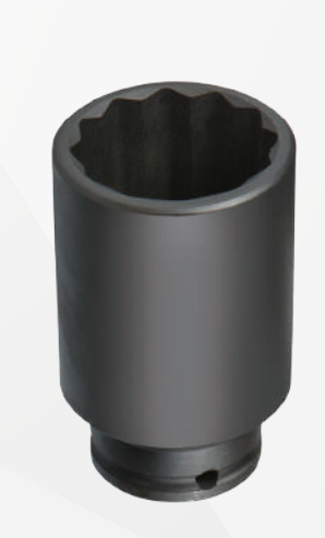
Axle Nut Socket