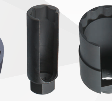
Oxygen Sensor Socket