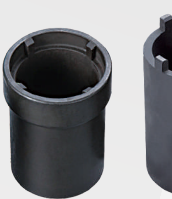
Lock Nut Socket