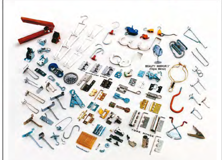
Kingbolt Metal offers a wide range of products, such as wire products, hooks and hardware.