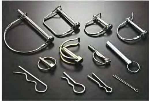
Nan Shun Spring makes precision springs and a wide range of industrial parts.

At present, Nan Shun's major product lines cover