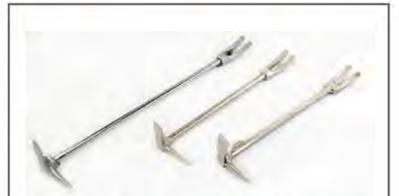
Forgecraft provides quality standard escape bars of all sizes.