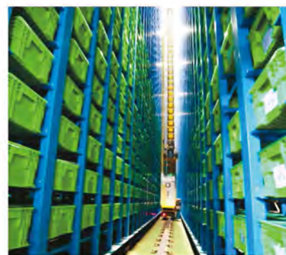
Easen's automatic inventory system.

Variety, variation, and efficiency have become the keys to success when facing fierce global competition. They demonstrate the advantages of consistent operation in design, sample production, quality inspection, packaging, automated warehouse, and