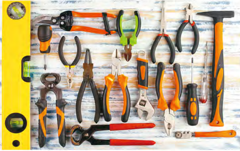
A file photo of various tools.

The program was in its second year, with many metal industry suppliers implementing lean manufacturing concepts to achieve digital manufacturing as their first step. This allows suppliers to quickly identify inconsistencies and issues early in the simplified, lean manufacturing process and improve flexibility to adapt to fast-changing market trends.