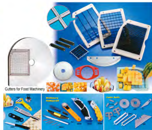
Tai Min produces a wide range of cutters for food machinery.

Established in 1985, Tai Min Industrial Co., Ltd. specializes in making blades and parts for food-making machines as a veteran supplier in Taiwan's central city of Taichung.