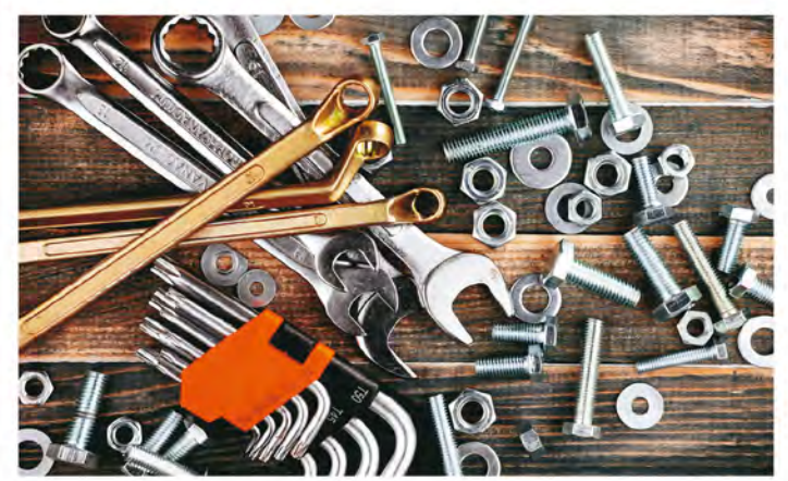
A file photo of various tools and hardware.