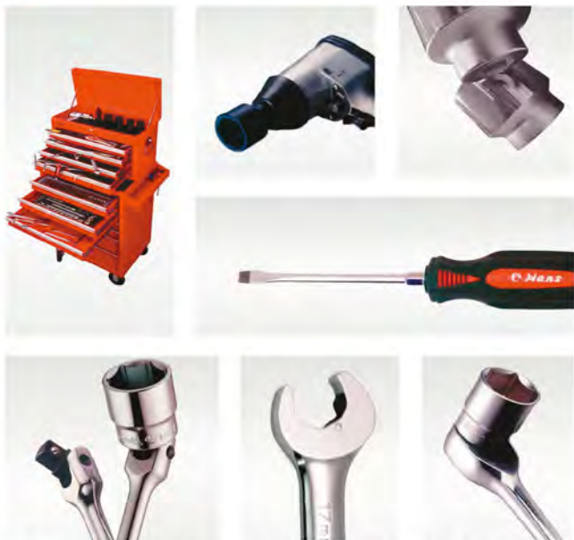
Hans Tools offers a varied selection of tools for automotive and construction use.

Hans Tools offers a broad selection of tools for industrial use spanning across the global market. Customers worldwide are dedicated to their work and expect to receive top-notch service from their partners. "Go for the Best, Trust and Respect"