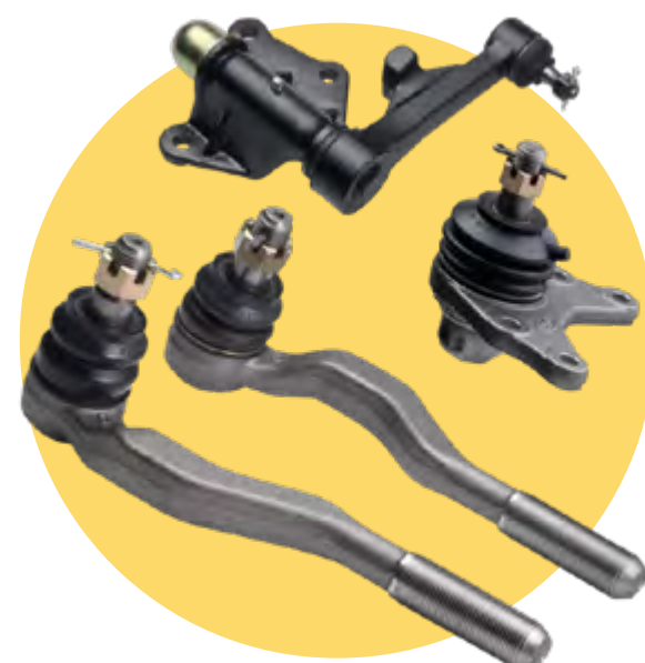
• Sloop Spare Parts offers a range of high-quality aftermarket (AM) automotive steering and suspension parts.

In addition to making products for sale under its own SLOOP brand, the company also takes OEM/ODM orders that are fulfilled to the strictest specifications.