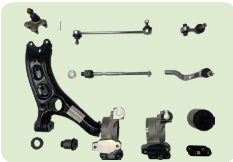
• At present, Trans Spur boasts an extensive inventory of more than 7,000 steering and suspension components.

With Quality Management Systems, combined with ample and stable quality supply components from their subcontractors, Trans Spur was able to achieve a production and turnover rate of over 80,000 pieces per month, with 30 to 90-day delivery lead time after ordering. Together, with key foundations like strict product quality control, strong R&D ability, wide product range, competitive pricing, prompt delivery, and superior service, Trans Spur is fully equipped to leverage its over four decades of experience in the worldwide aftermarket of suspension and chassis parts.