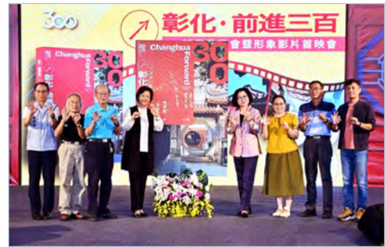
• With an impressive network of over 470 automotive parts suppliers, Changhua County has emerged as an automotive manufacturing powerhouse.

bicycles, plastic products, machinery equipment, and food products. The overarching objective is to aid members in adopting a "Based in Changhua, Taiwan, with a global perspective," thereby extending the business reach worldwide.