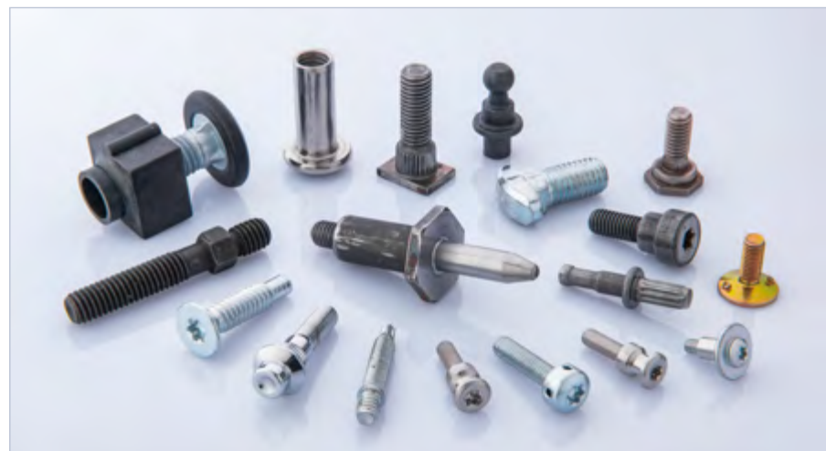
• Ray Fu produces high-quality auto parts and offers comprehensive solutions to assist customers in achieving sustainability transformations.

Moreover, dedicated to providing comprehensive solutions that help customers achieve sustainable goals, including green buildings, green energy industries, and electric vehicles, Ray Fu is ISO 14064-1 certified for greenhouse gas inventory. Additionally, it is setting up energy monitoring systems within its factory areas. By collecting and analyzing energy data, this initiative enables the swift adjustment of equipment energy consumption and waste reduction during production. The company takes pride in promoting the digital transformation of its factory areas, with an unwavering commitment to delivering high-quality products and services that meet the evolving needs of customers in the future.