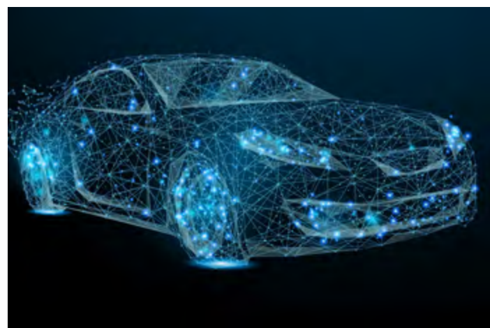
• Electric vehicles depend on vehicle telematics and motors, areas in which Taiwan excels.