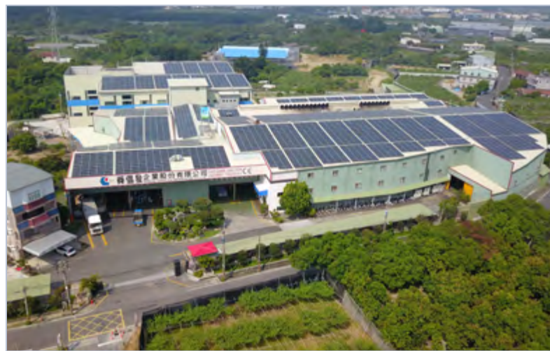
• SCF's factory is now equipped with fully installed solar panels.

Additionally, SCF provides a comprehensive range of customized screws, with lengths spanning from 10mm to 1000mm, offering customers a one-stop solution to meet their diverse needs.