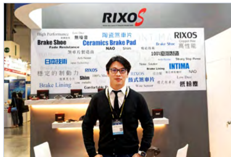
• TBT has consistently maintained its industry leadership by placing a strong emphasis on research and development, particularly in the field of brake pads.

AMECA, and others, facilitating seamless connections with the global market.