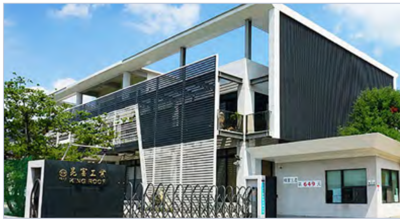
• Through collaborative partnerships with OEM customers, King Roof aims to champion quality products on a global scale.

In the company's relentless pursuit of excellence and its commitment to promoting the concept of life sustainability as well as the use of renewable materials, King Roof leverages its extensive manufacturing experience and an R&D / QA team which is comprised of highly experienced engineers. Augmented by cutting-edge software and hardware capabilities, King Roof undoubtedly stands as your ideal manufacturing partner.