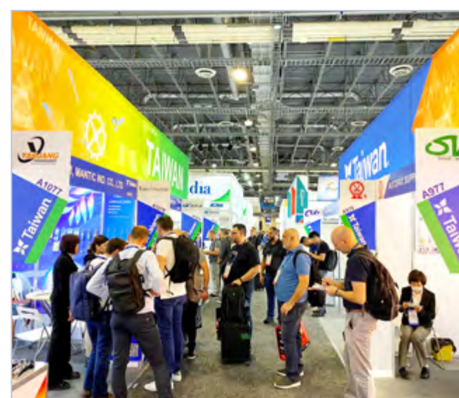
• Organized by Economic Daily News/CENS, the Taiwan Pavilion is always popular among buyers at the AAPEX exhibition.

Moreover, CENS maintains a booth (J9756 - UDN) at the venue, facilitating the distribution of AAPEX 2023 Show Express and professional trade magazines, including the latest edition of the Taiwan Transportation Equipment Guide (TTG) and Taiwan Hand Tools along with a portable USB version. These publications not only provide insights into industry trends and highlights from prominent exhibitions but also feature well-recognized Taiwanese suppliers and their high-quality products. Additionally, real-time business matchmaking services are available during the exhibition, enabling professional buyers to connect with suitable Taiwanese suppliers, even those not physically present at the fair.