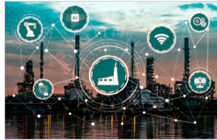
• Over time, AI's capabilities grow exponentially, enabling it to predict maintenance requirements and anticipate potential breakdowns well in advance.

and anticipate potential breakdowns well in advance.