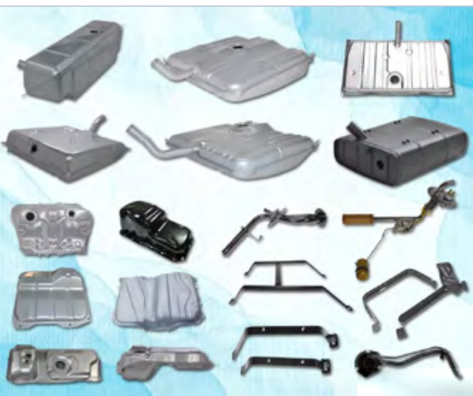
• UN Fuel Tank specializes in supplying fuel tanks, oil pans, fuel filler necks, and a variety of related components.

Additionally, by leveraging its successful business expansion experience in North America, UN Fuel Tank's next strategic move is to establish an even stronger business presence in Europe, reaffirming its commitment to the market.