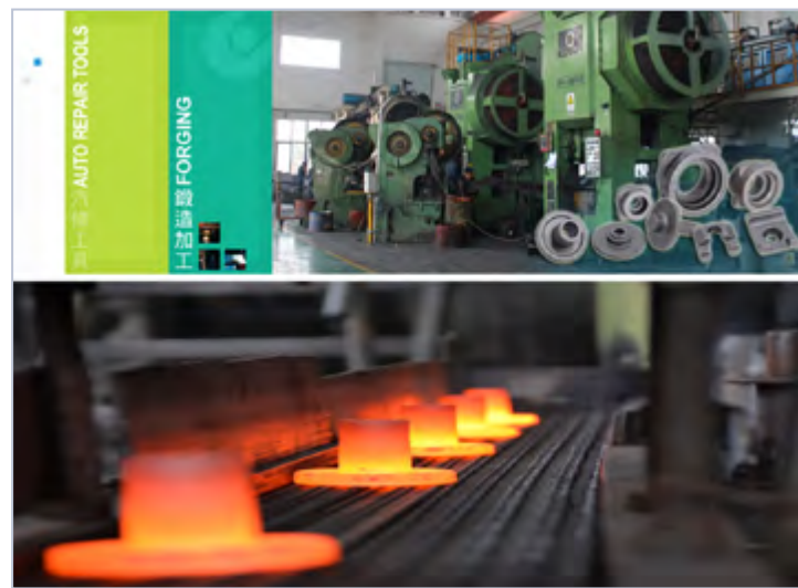
• TOP-RANK consistently produces top-quality products with precision manufacturing.