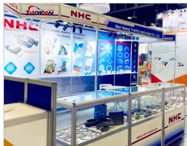
• Nan Hoang exhibits at the AAPEX trade show in the USA, featuring a wide range of products and welcoming international buyers to inquire.

In the past 62 years, Nan Hoang Traffic Instrument Co., Ltd R&D team with accumulated professional experience and advantages for friction materials production. Key technologies are also established, including complete, multi-functional and sophisticated testing equipment. It provides testing capabilities for physical property, analysis, comparison so diversified friction material selection is provided for markets. More than 8,000 friction products have been developed, and they are applied to various industrial, mechanical equipment, and automobile products. The product has been certified CNS certification and manufactured in Taiwan. It has received SGS, R90, R78 and TUV certifications. It is also in compliance with ROHS and REACH regulations. It can meet global OEM, OES and AM market requirements.