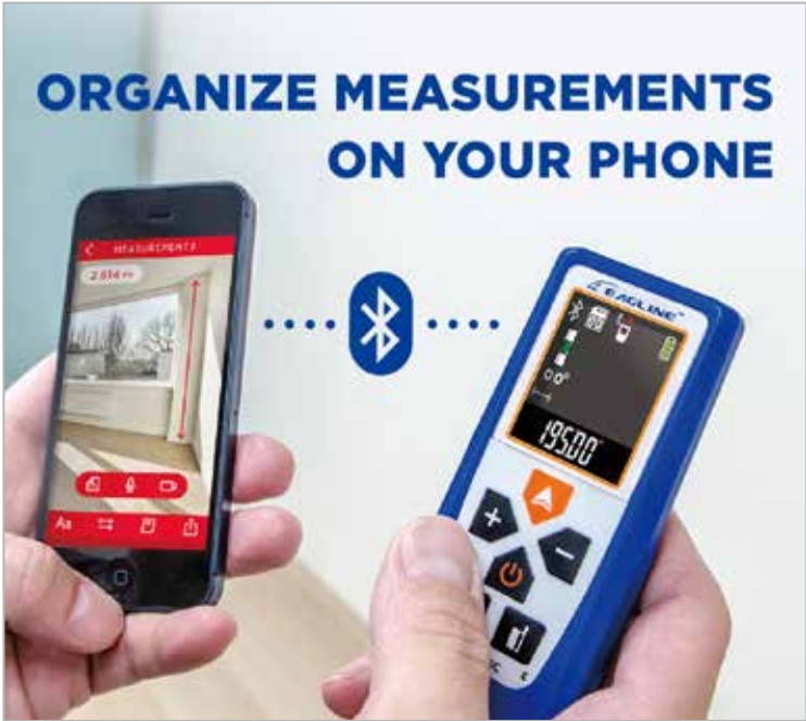
Choosing EAGLINE means more than acquiring a tool; it is an investment in a partnership dedicated to excellence and precision.