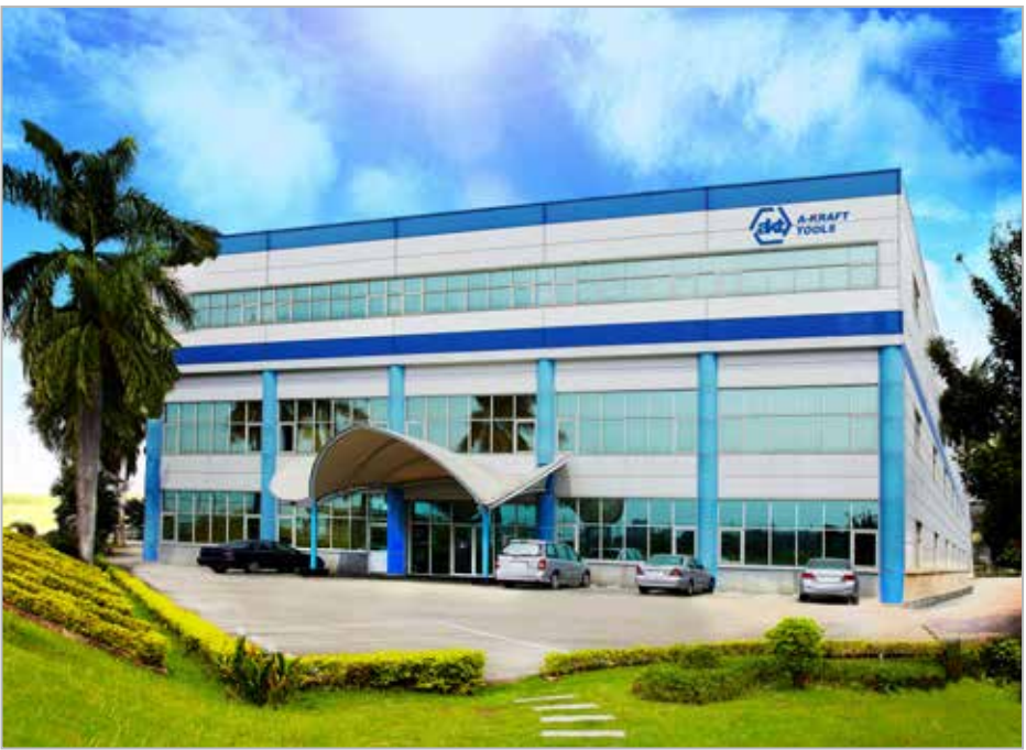
A-KRAFT employs a strict quality control system, ensuring precision and consistency in their product design.

Since its establishment in 1985, Tai Cheer Industrial Co. LTD. has been a dedicated supplier of a diverse range of steel ball slide rails. These precision-crafted rails find applications in furniture, kitchen furniture, tool carts, white goods, vehicle seats, ATMs, medical instruments, and various other