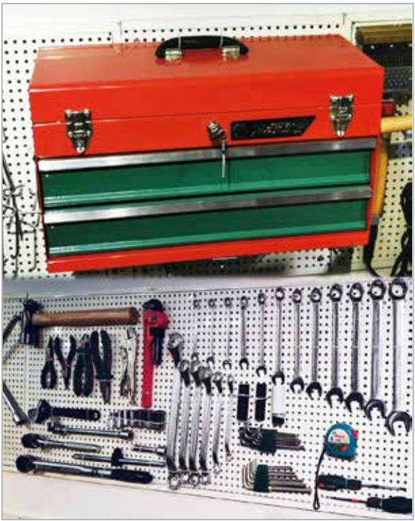
Hans Tools 9903TC-61, a versatile 61-piece toolset designed specifically for tire changers.

CHEN HOUSEHOLD HARDWARE SUPPLY CO., LTD.