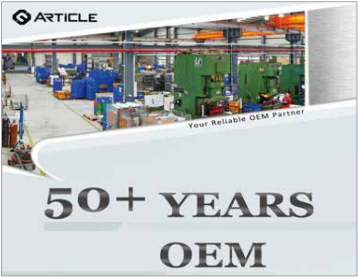
Chia Cheng specializes in the manufacture and export of washroom accessories, bathroom accessories, and toilet partition hardware as an OEM supplier.

resource regeneration and utilization. Chia Cheng is the one clients can trust, as they create added value through diversified service while assisting clients in enhancing their products.