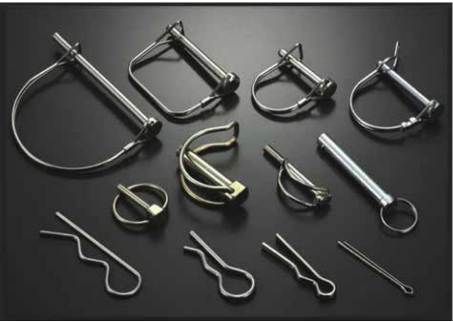
Nan Shun Spring makes precision springs and a wide range of industrial parts.