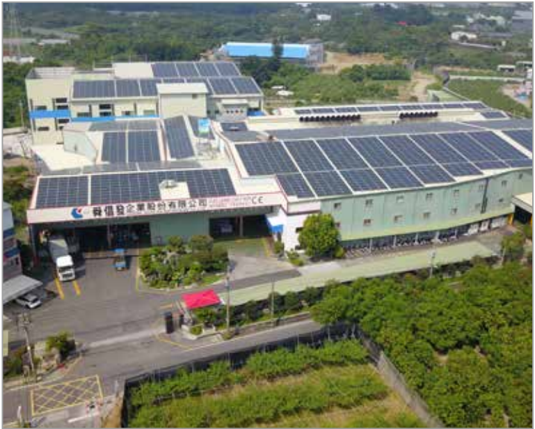
SCF's factory is now equipped with fully installed solar panels, capable of generating 1,500,000 kWh of electricity annually, equivalent to reducing carbon emissions by 750 metric tons of CO2e each year.