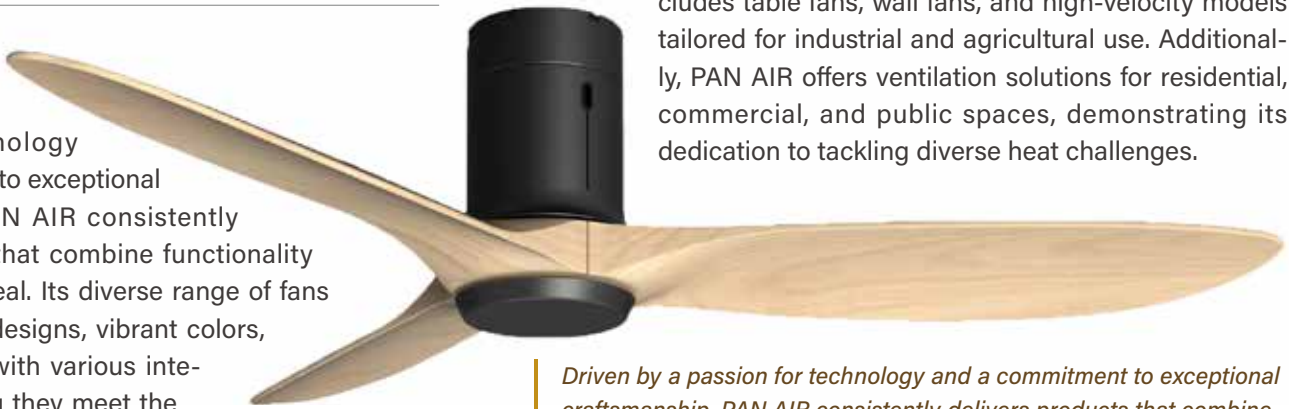
Driven by a passion for technology and a commitment to exceptional craftsmanship, PAN AIR consistently delivers products that combine functionality with aesthetic appeal.