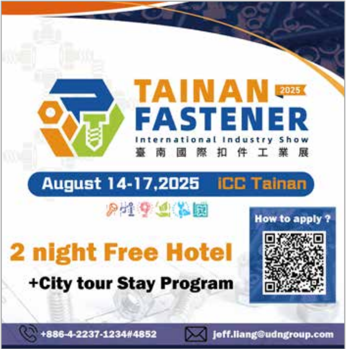
The Tainan Fastener International Industry Show 2025 will gather top manufacturers under one roof.

The Tainan Fastener International Industry Show 2025 will gather top manufacturers under one roof, providing a dynamic platform to explore innovations, expand business networks, and discover new opportunities. For further details, visit the official website: http://www.tainanfastener.com/en/index.html .