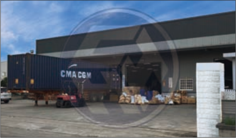
CHH is a Taiwanese manufacturer of household hardware and plumbing products from the heart of Chang Hua.

name it, we've got it covered! But wait, there's more! We're ISO 9001 certified and have passed the SER/CTPAT audits requested by industry giants like THD and Wal-Mart. We also understand that time is money. That's why we offer vendor-stocked inventory for high-volume SKUs. No more waiting around for parts, we'll get them to you lightning fast, so your projects stay on track. Last but not least, our experienced engineering team is ready to collaborate in specializing OEM parts and offer valuable insights, ultimately bringing your project to life. Ready to get started? Head over to our website at www.chh.supply or contact us directly at 886-4-2254-8698. We're always happy to chat and explore solutions!