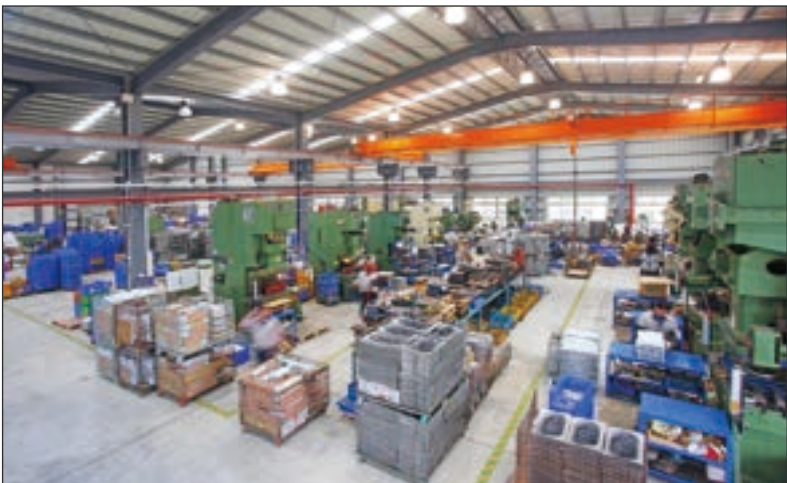
Chia Cheng has earned ISO 9001, ISO 1400 certifications.

flexible production tailored to customer specifications. As a trusted OEM partner, Chia Cheng leverages technical expertise to provide high-quality customizations for global buyers seeking long-term collaboration.