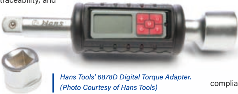
Hans Tools' 6878D Digital Torque Adaptor.

zation. The goal is not technology for show. The goal is operational outcomes—less rework, fewer failures, faster diagnosis, and higher consistency. Digital torque, traceability, and data-driven workflows are the bridge between human craftsmanship and enterprise-grade reliability. At the same time, the “future of work” is not