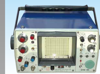
超音波探傷機 Ultrasonic Flaw Detector