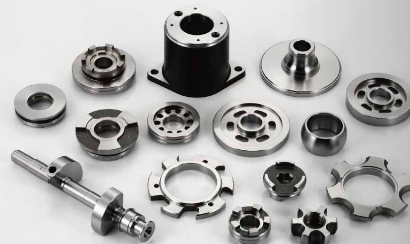
機械加工 MECHANICAL WORKOUT