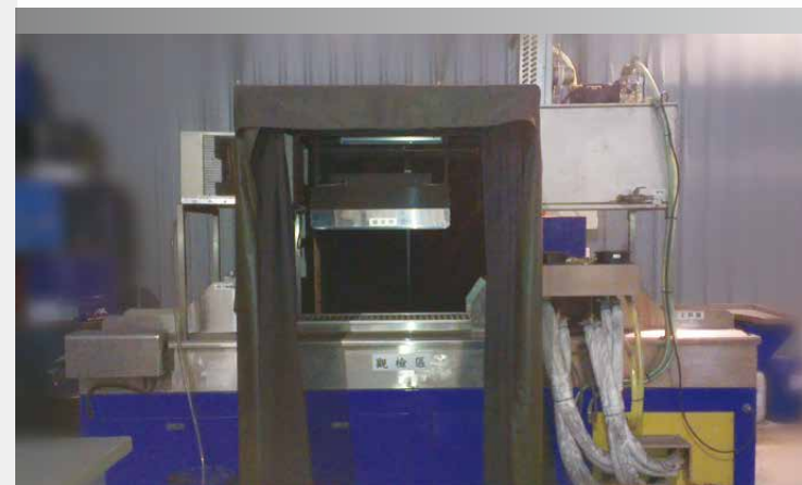
磁粉探傷機 Magnetic Particle - testing Machine