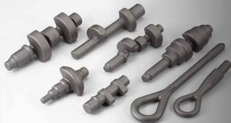
機械類 MECHANICAL PARTS