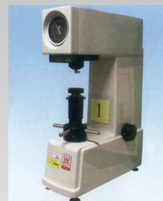
洛氏硬度機 Rockwell hardness - tester