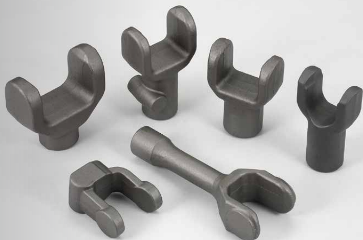
汽機車凸輪軸類 / 汽機車齒輪類 AUTO, MOTORCYCLE CAMSHAFTS / AUTOMOTIVE, MOTORCYCLE GEARS