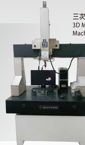
三次元量測儀 3D Measuring Machine