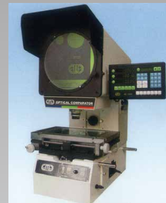
投影機 Profile Projector